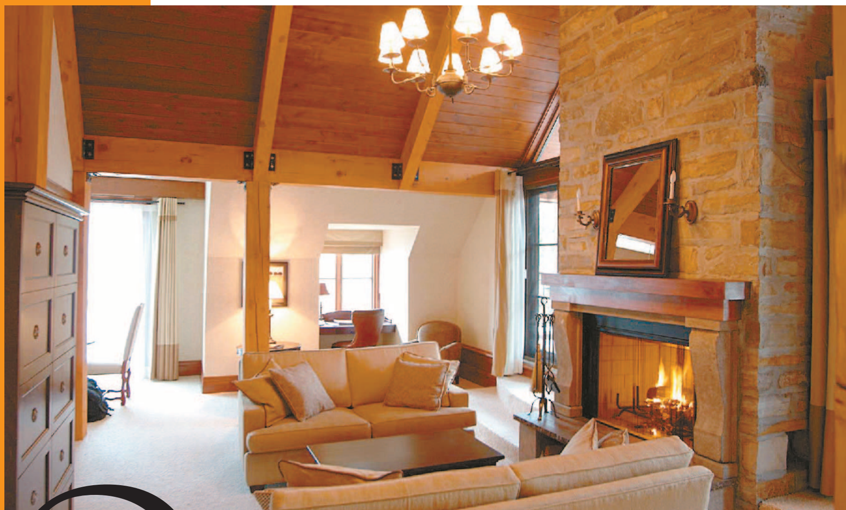
Two enormous 'presidential suites' have private terraces, outdoor hot tubs and fireplaces.